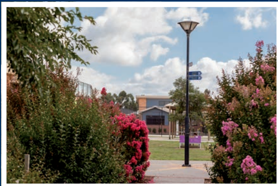
Pakenham Kinder – Year 12