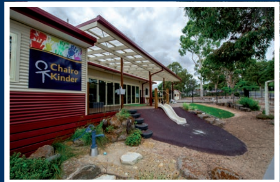
Traralgon Kinder – Year 8