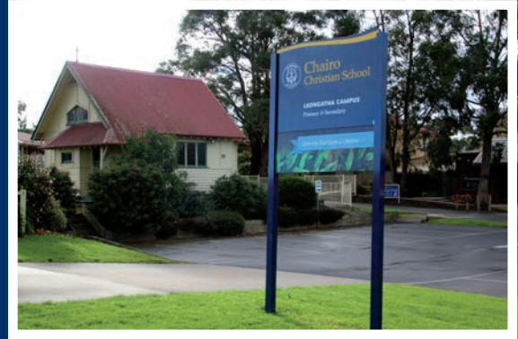
Leongatha Kinder – Year 10