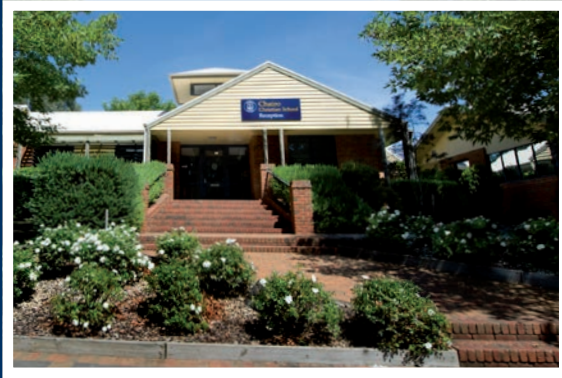
Drouin / Drouin East Kinder – Year 12